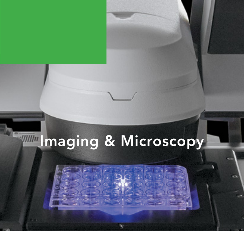
Imaging & Microscopy